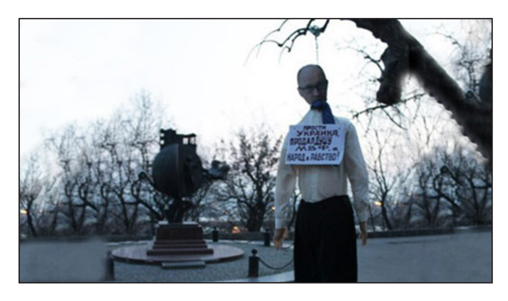
Figure 9: The Effigy of Ukrainian Prime Minister Arseniy Yatsenyuk Hanging in Odesa