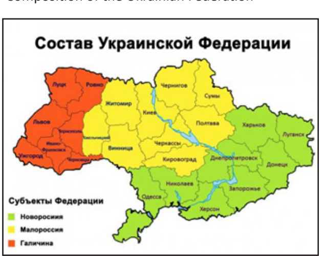
Figure 3: One of the Maps of the 'Ukrainian Federation' Sent by Pushilin to Surkov, Entitled 'Composition of the Ukrainian Federation'